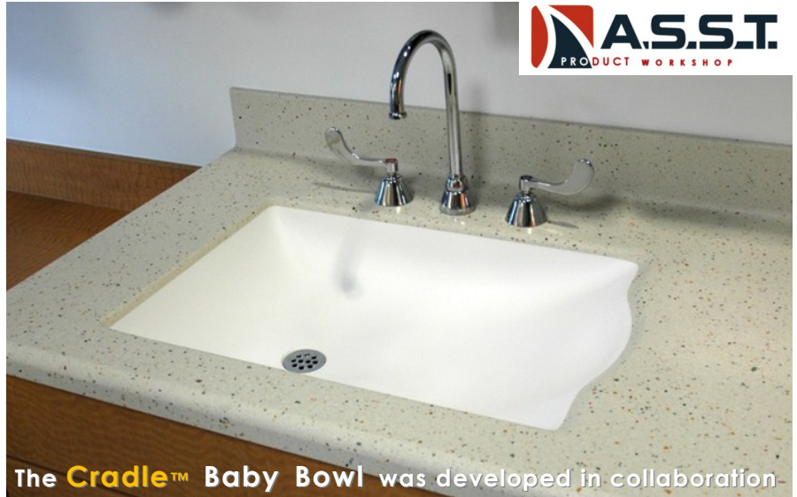
The Cradle™ Baby Bowl was developed in collaboration

with the labor and delivery nursing team at St. Joseph's in Baltimore, Maryland. The hospital needed a solution that was integrally mounted, seamless and provided the proper ergonomic support for a newborn. ASST created a design for St. Joseph's utilizing our patented thermoforming technologies that not only satisfied their needs, but has also provided a product solution for other hospital systems nationwide.