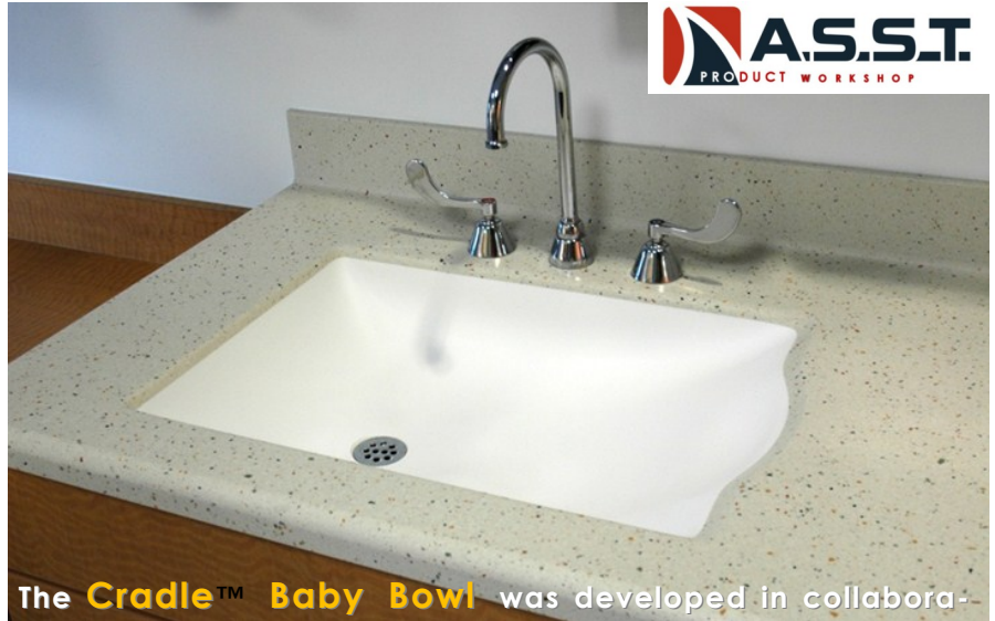
The Cradle™ Baby Bowl was developed in collaboration

with the labor and delivery nursing team at St. Joseph's in Baltimore, Maryland. The hospital needed a solution that was integrally mounted, seamless and provided the proper ergonomic support for a newborn. ASST created a design for St. Joseph's utilizing our patented thermoforming technologies that not only satisfied their needs, but has also provided a product solution for other hospital systems nationwide.